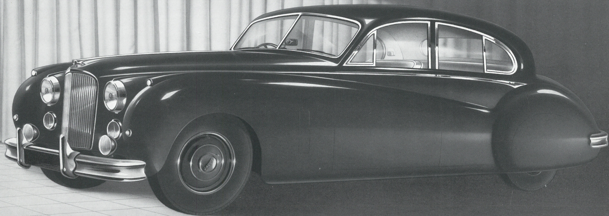
THE JAGUAR TYPE "M" MARK VII SALOON